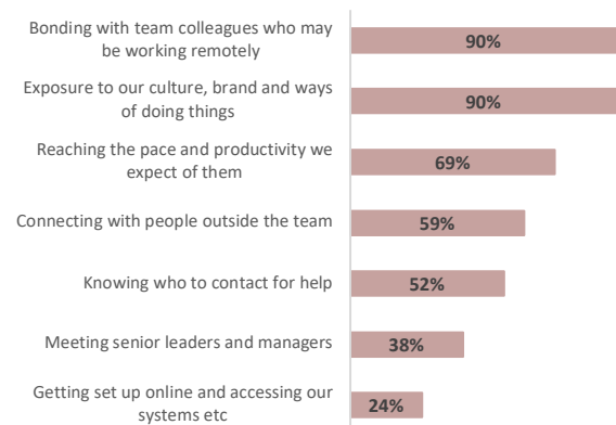
Fig 3: Recruiter responses identifying what has become harder during onboarding

For any areas that have been identified as weaknesses during the selection stage, there could be a development goal set as part of onboarding. This would help the recruit meet the required pace and productivity more easily.